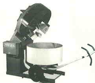
ZZ 150 HE