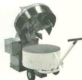
ZZ 75 HE