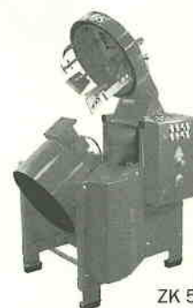
ZK 50 HE