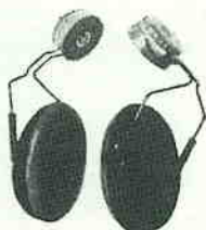
H 6 P 3 A