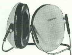
H 6 B