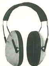
H 6 A