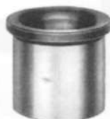
1) DIN 172