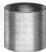
2) DIN 179